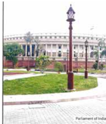
Parliament of India

only strengthened the company's position in India but also expanded its global footprint. Under her leadership, K-Lite has supplied custom lighting solutions to prestigious projects, including the Indian Parliament area, the Parliament complex in Cairo, and renowned religious sites like the Golden Temple in Amritsar, Ayodhya, and Varanasi. Her journey reflects her ability to blend design with innovation, driving K-Lite's success both locally and internationally. A cherished memory of hers is spending time with Ratan Tata, whose leadership and values profoundly impacted her.