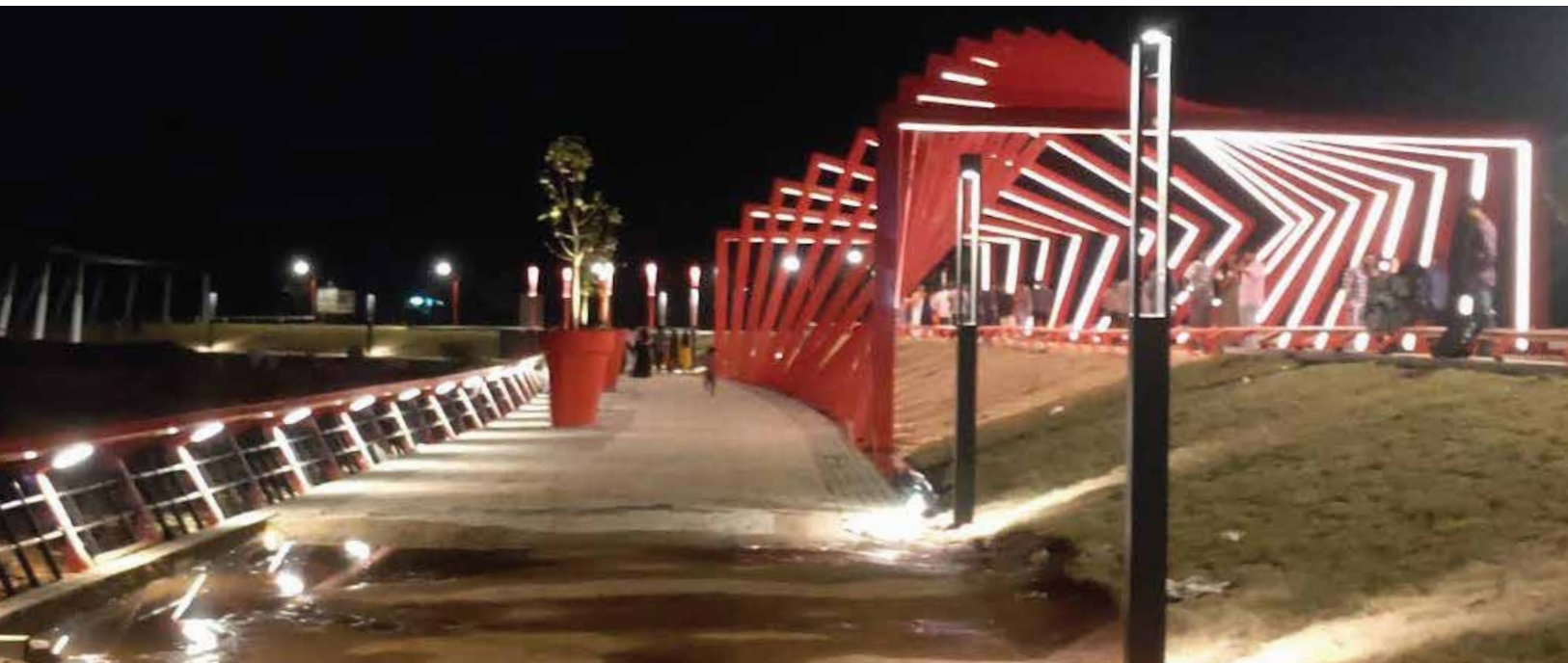
KOMATI CHERUVU, SIDDIPET