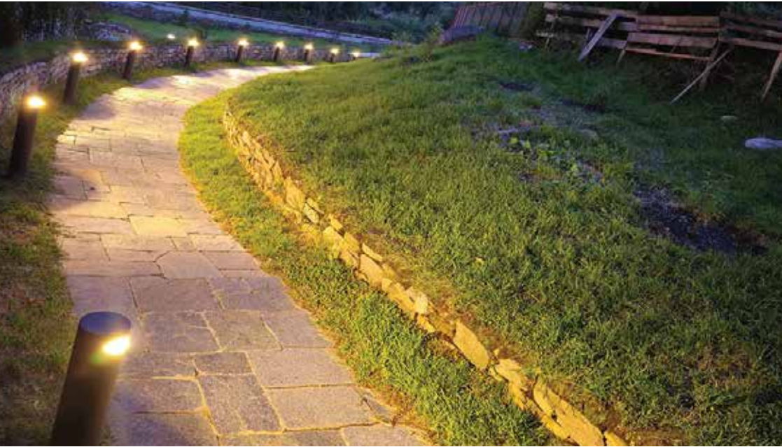
WANG PALACE, BUMTHANG, BHUTAN