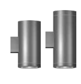
AVM ASTA, CHENNAI