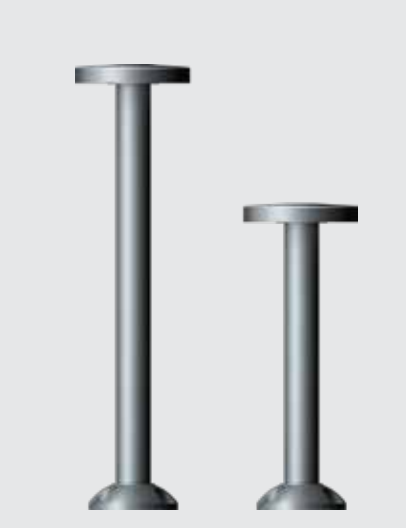
PARK HYATT, CHENNAI