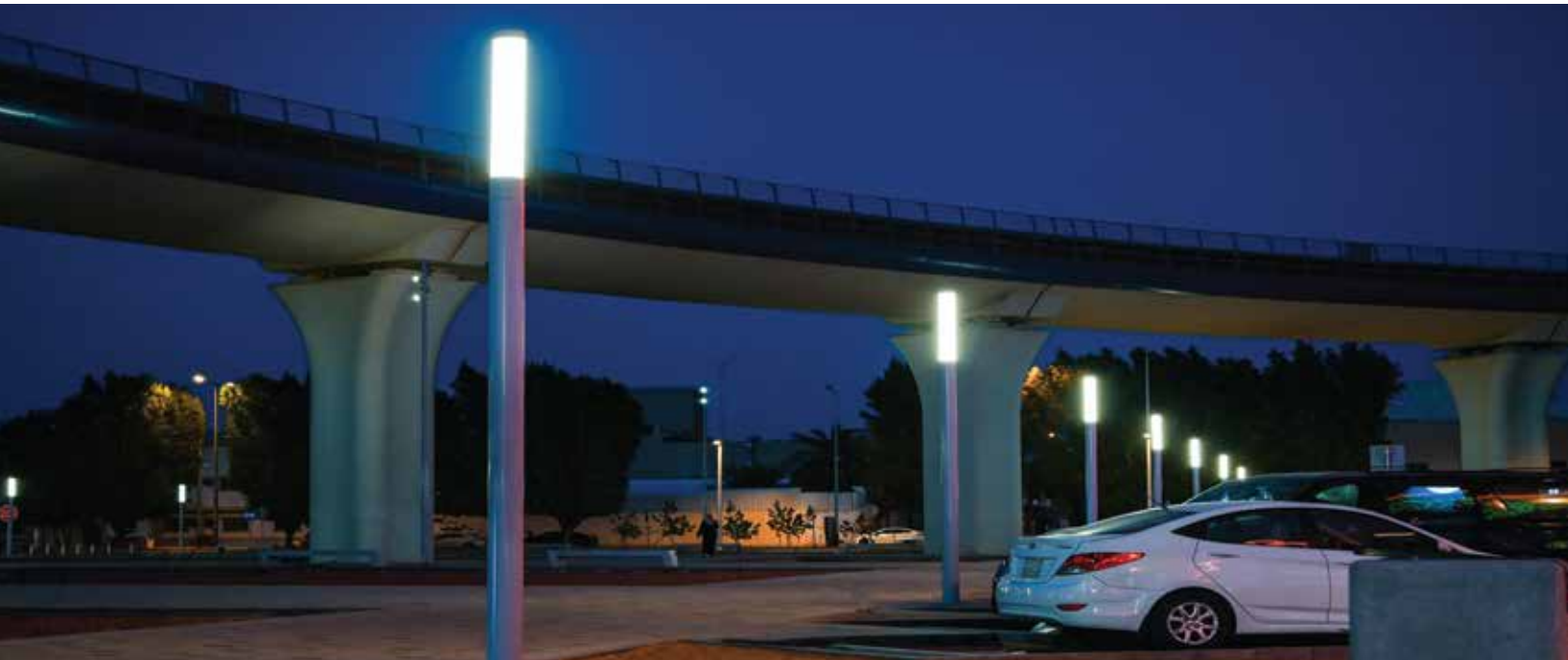
RIYADH METRO OBC ZONE, UAE