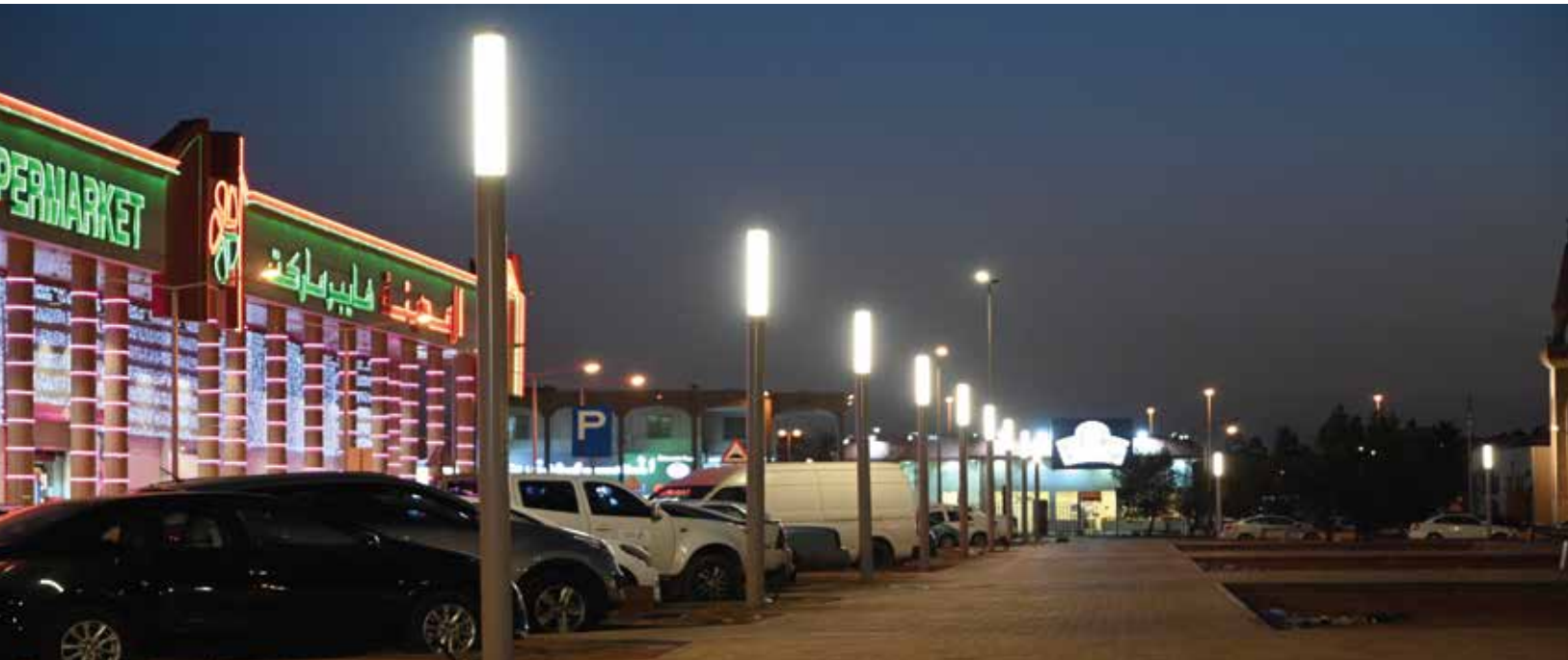
RIYADH METRO OBC ZONE, UAE