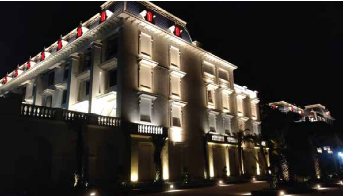
TAJ WELLNESS, GANDHI NAGAR