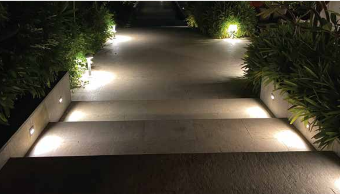
VR MALL, CHENNAI