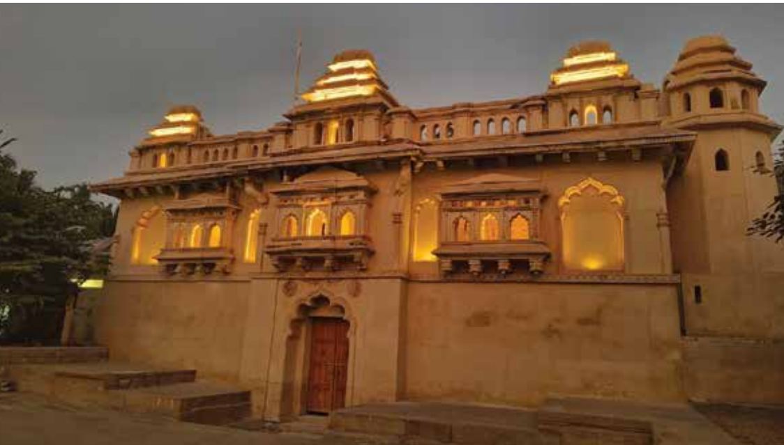
GAGAN MAHAL PALACE, HAMPI