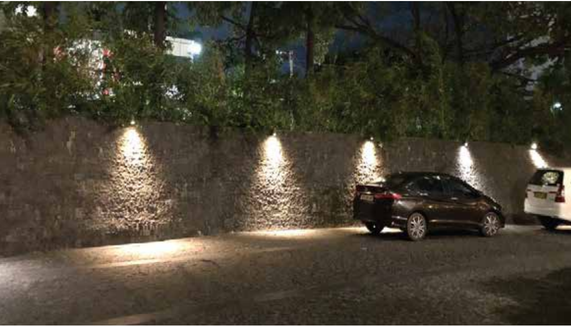
PARK HYATT, CHENNAI