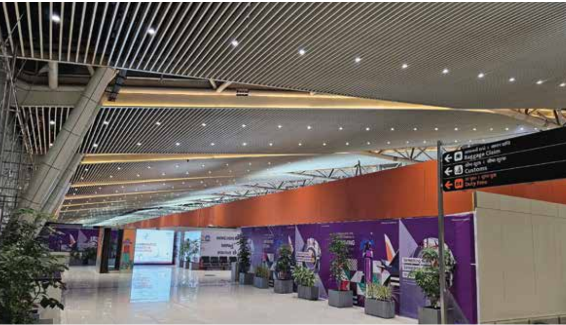
AHMEDABAD INTERNATIONAL AIRPORT