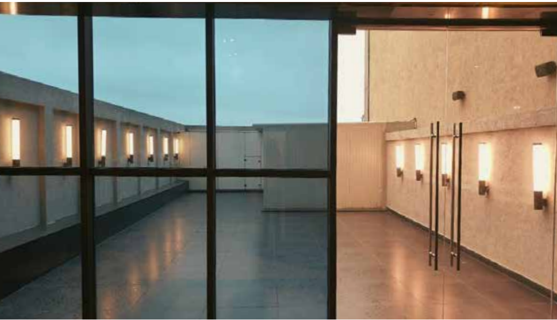
NEELKANTH STAR HOTEL, SONIPAT