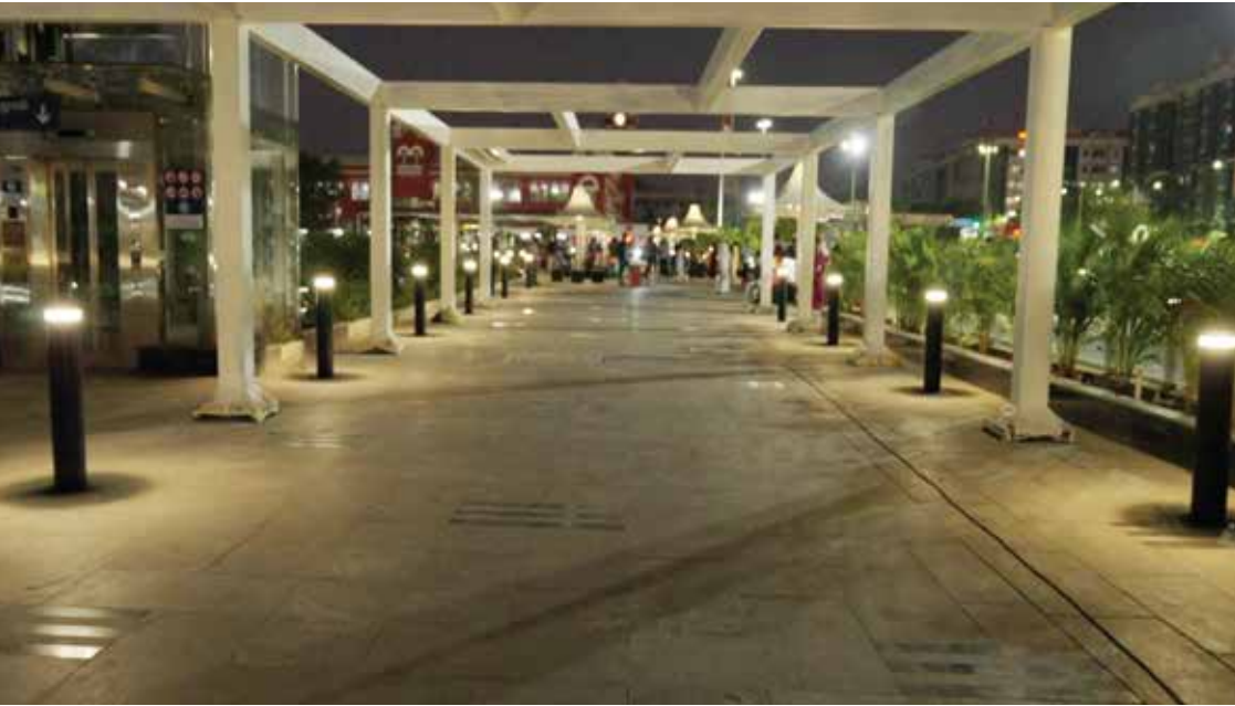
MGR CENTRAL STATION ARENA, CHENNAI